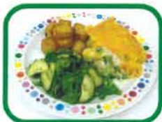
Salmon Pasta Bake (F.D.G.)