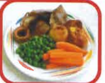
Roast Beef in Gravy