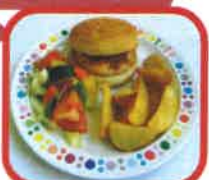
Chicken Fillet in a Bun (S.G.)