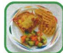
(v) Vegetable Burrito (D.G.)