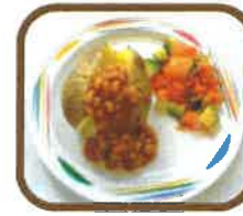
(v) Jacket Potato with Cheese and Beans (D.)