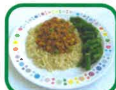
(v) Vegetarian Curry (G.SB.M.)