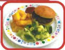
Organic Beef Grill (G.) in a Bun (S.G.)