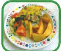
Tuna Pasta Bake (D.F.G.)