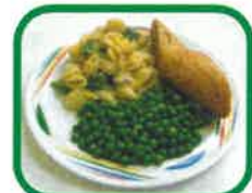
(v) Pasta with Broccoli and Sweetcorn (D.G.)