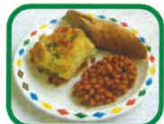
(v) Cheesy Pasta