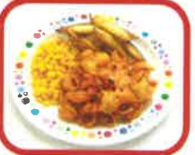
Cheesy BBQ Bacon Pasta (G,D.)