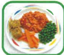
(v) Cheesy Tomato Risotto (D.)