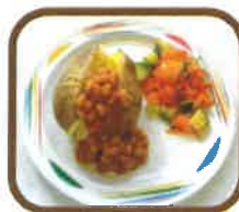
(v) Jacket Potato with Cheese and Beans (D.)