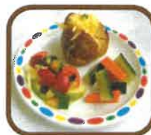
(v) Jacket Potato with Cheese (D.)