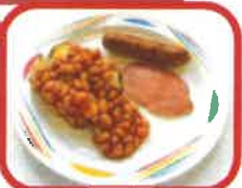
Bacon Medallion and Pork Sausage (G.S.U.)