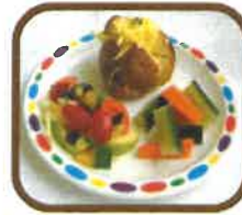
(v) Jacket Potato with Cheese (D.)