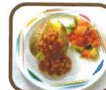
(v) Jacket Potato with Cheese and Beans (D.)