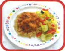
Mild and Creamy Chicken Curry (D.)