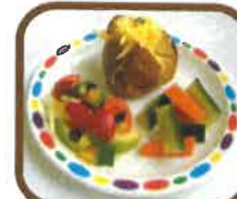
(v) Jacket Potato with Cheese (D.)