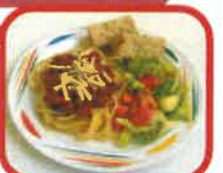
Spaghetti Bolognese (D.G.)