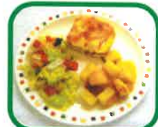
(v) Farmhouse Omelette (D.E.)