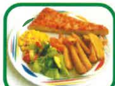
(v) Cheese and Tomato Pizza (D.G.)