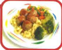
Organic Pork Meatballs (G.)