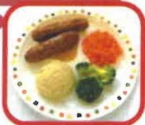
Pork Sausages (G.SU)