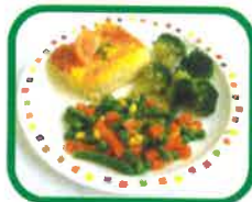
(v) Cheddar Cheese and Potato Pie (D.E.)