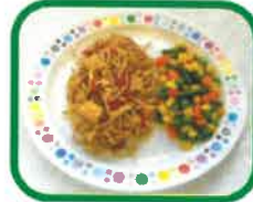
(v) Chinese Style Quorn with Noodles (SB,E,G.)