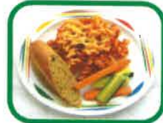
(v) Pasta in a Rich Tomato Sauce (D,G.)