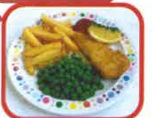
Battered Fish Fillet (G.SB.F.)