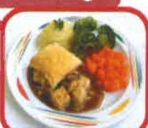
Chicken Pie (D.G.)