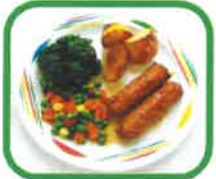
(v) Veggie Sausages (G.SU.SB)