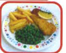
Breaded Pollock Fillet (F,SB.)