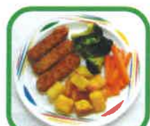
(v) Breadcrumbed Vegetable Fingers (G.)