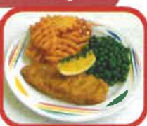
Battered Fish Fillet (G.F)